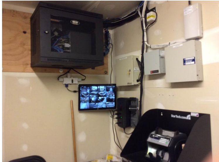
Security & Surveillance Room